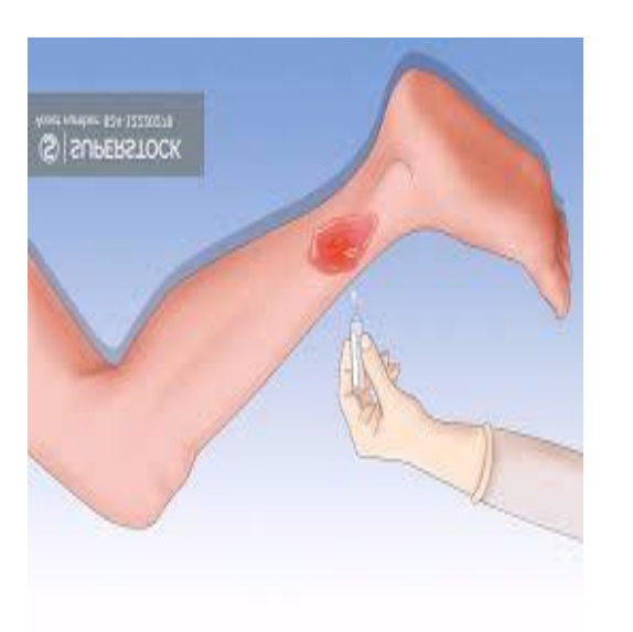
WOUND CARE: Soap and water. Gently pat dry