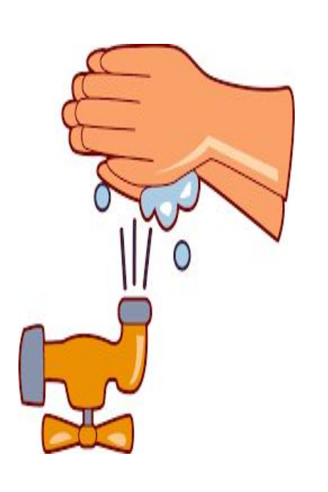
T. Wash your hands

can't give yourself naloxone if you OD. Make sure someone is with you and can call 911 in an emergency.